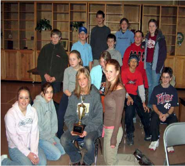
Treasure Hunt winners, January 10, 2004