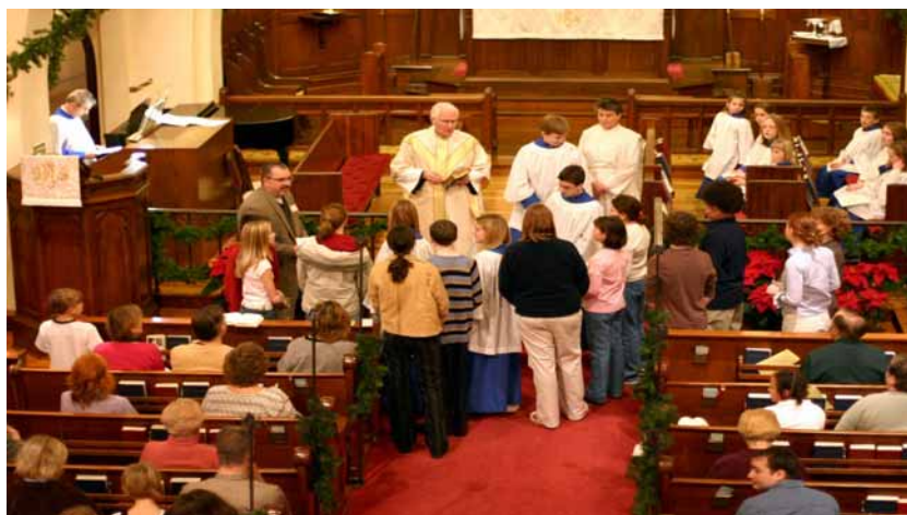
Acolyte Recognition Sunday, January 11, 2004

The "Voice" is published each month as the newsletter of The Episcopal Church of St. John in the Wilderness, White Bear Lake, MN 55110